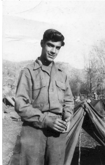
“our mascot in Italy” (?)