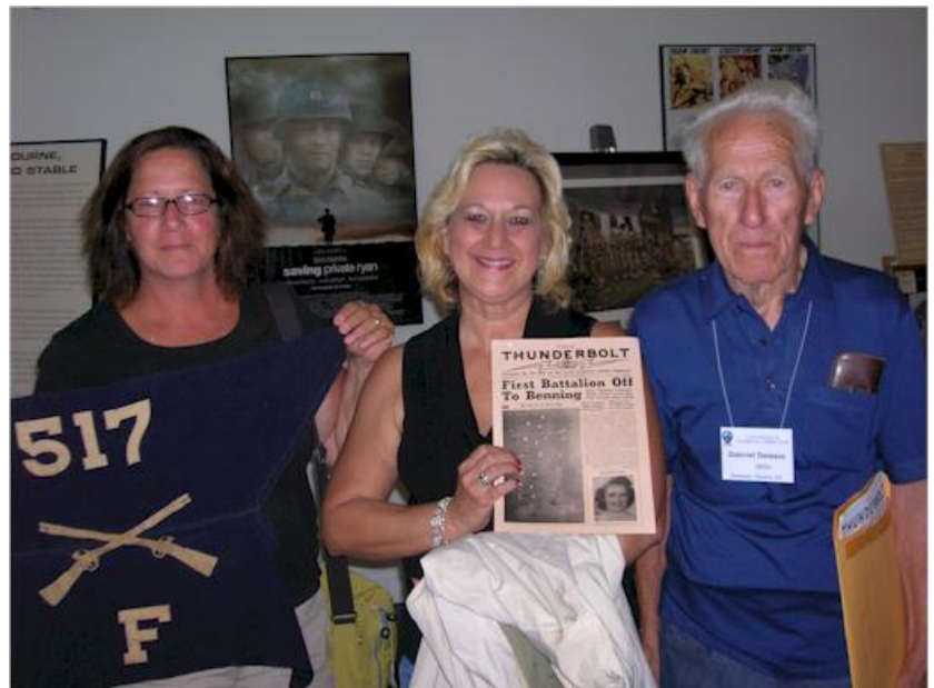
At the Toccoa Currahee Military Museum