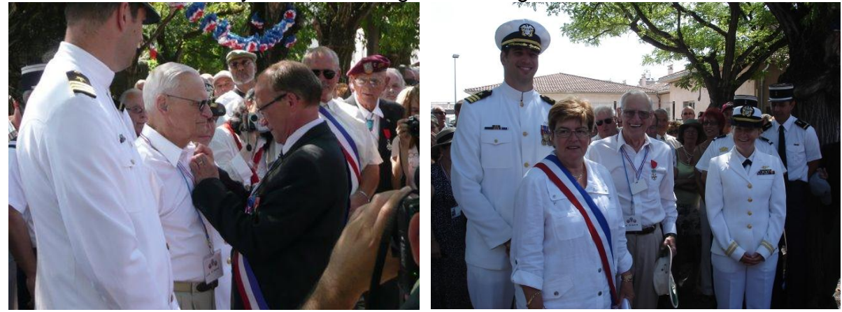
Le Muy, 2004:

Le Muy 2009, receiving French Legion of Honour: