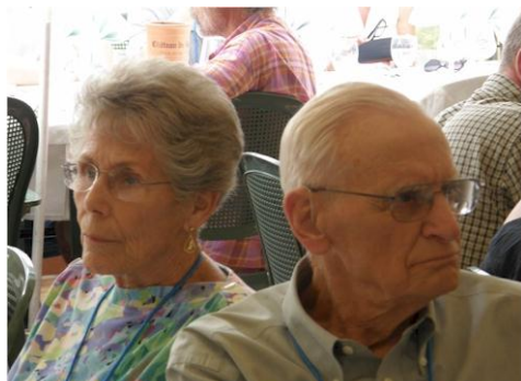
MailCall # 2082