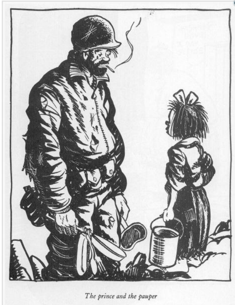
The prince and the pauper