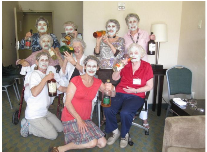
Women's Day Spa