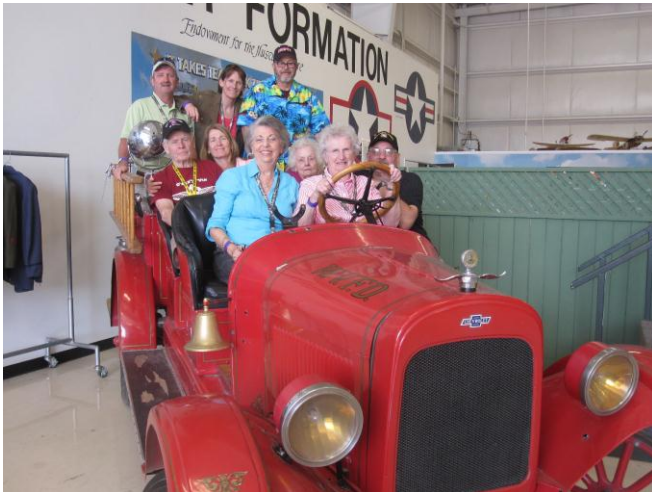
Trip to the Air Museum