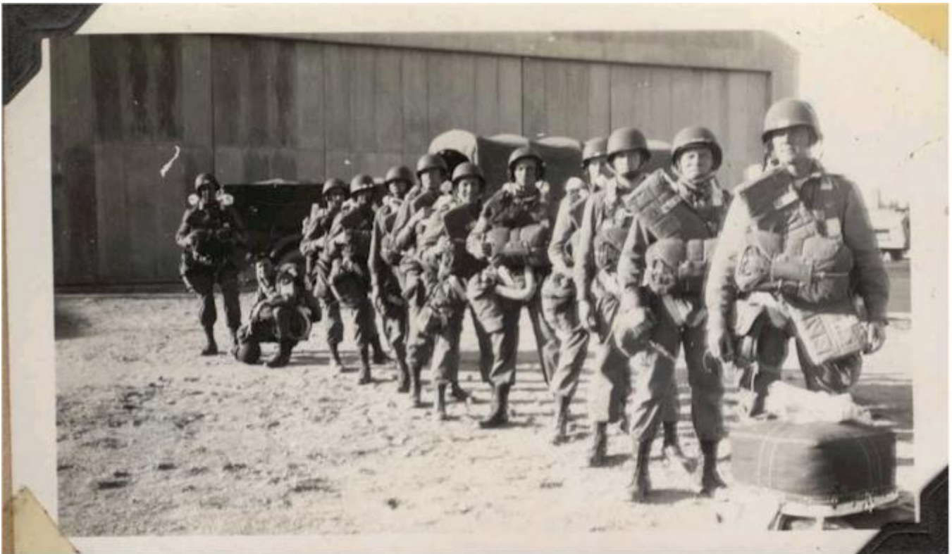
460 th PFAB at Camp MacKall - Thanksgiving jump 1943