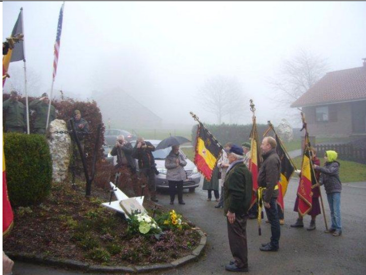
Logbiermé - ceremony at the 517th monument - 2013 JAN. 5th