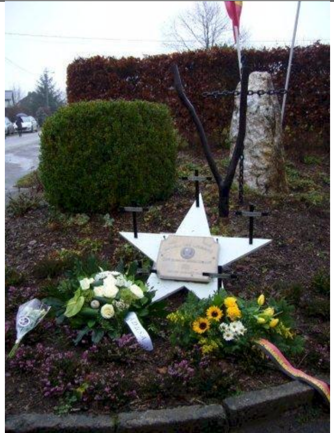
flowers in Logbiermé