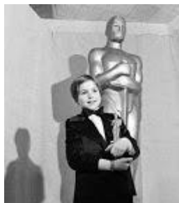
Ten years-old in 1974, Tatum O’Neil remains the youngest person to win a competitive Academy Award.

Tatum O’Neil (actually, only 9 years-old when she played the part of Addie Pray) won the Oscar for Best Supporting Actress in 1974, and she remains the youngest person ever to win a competitive Academy Award. Her father, veteran actor Ryan O’Neil, played the part of “Long Boy” Moses. Miss Trixie Delight was played by Madeline Kahn, and Randy Quaid played Leroy.