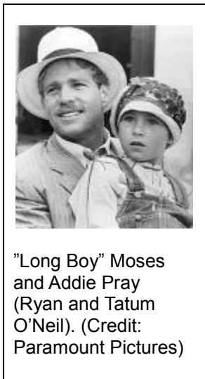
“Long Boy” Moses and Addie Pray (Ryan and Tatum O’Neil).

Narrated by 11 year-old con-artist Addie Pray, an orphan, who travels with scam/confidence man “Long Boy” Moses (he is one of three possible fathers of Addie), the pair strike out across the Deep South during the Depression-era 1930s trying their “luck” in every town, nook and cranny.