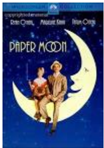
DVD cover for Paper Moon , originally released by Paramount Pictures in 1973.

From The Marion Times-Standard , Wednesday, September 9, 2009.