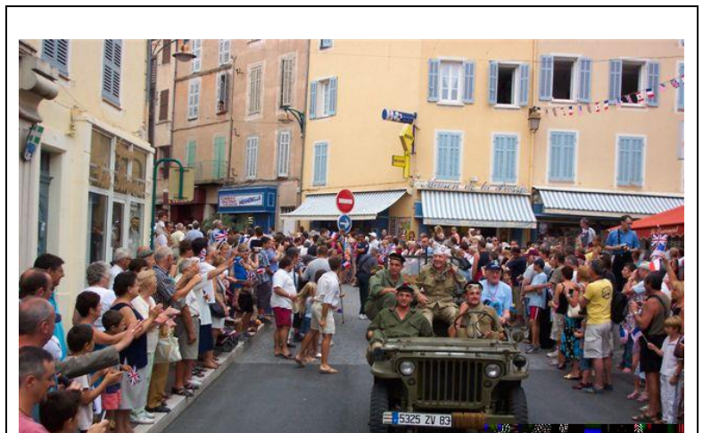
Anniversary of Operation Dragoon - 2004