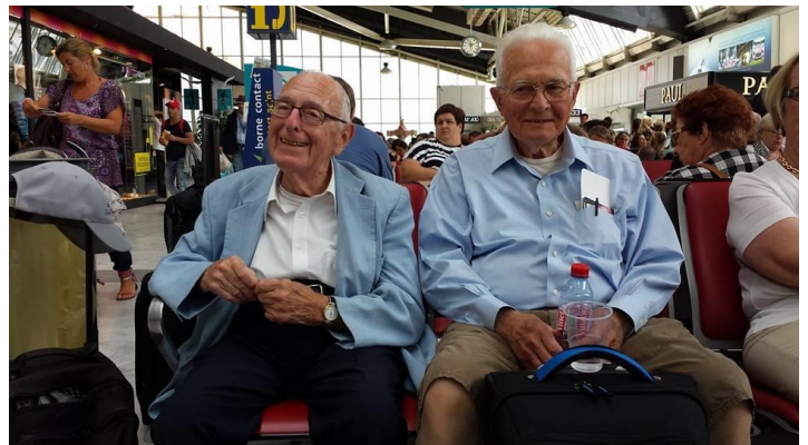
Waiting to board for the trip home.