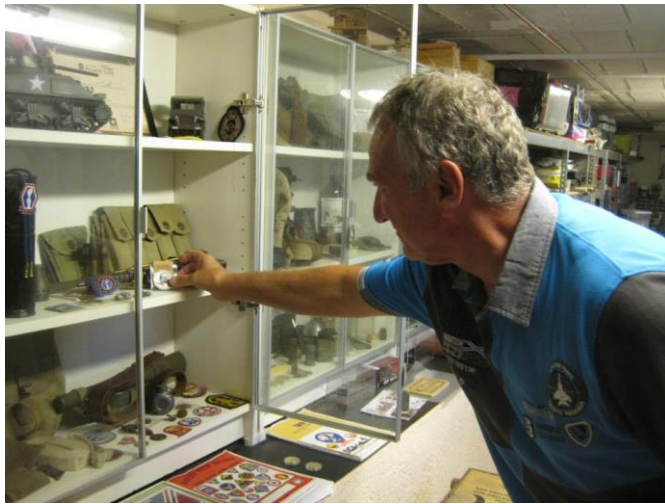
Roland's very own WWII museum

https://www.youtube.com/watch?v=CB9QJDI6iws