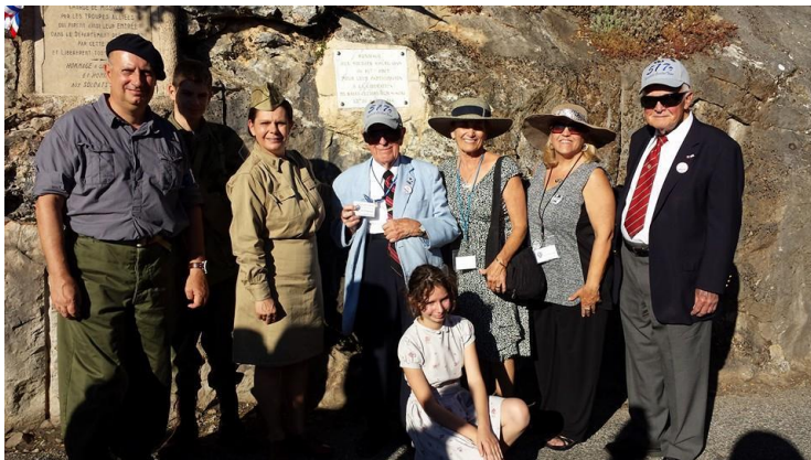
Saint-Cézaire, our last day and evening of official commemorations. Truly a lovely and heartfelt evening with such good friends.