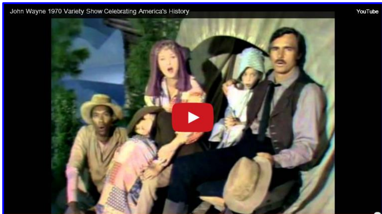
John Wayne 1970 leading God Bless America

http://biggeekdad.com/2014/09/john-wayne-1970/#.VCGDoNG-jXw.gmail