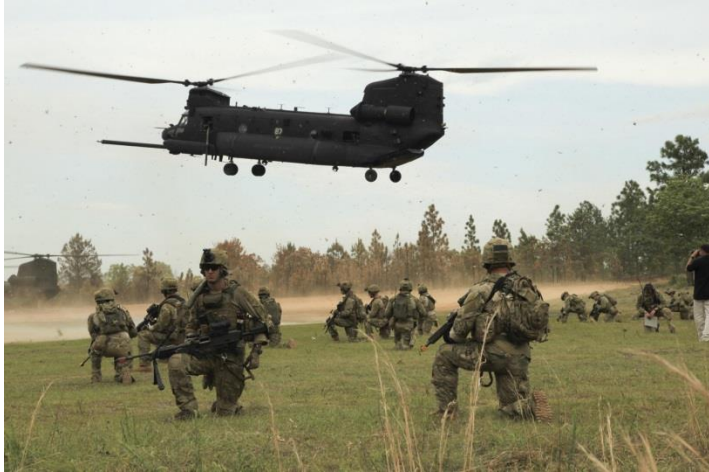
American commandos during an exercise in 2012. At top—a Special Forces soldier in Afghanistan.