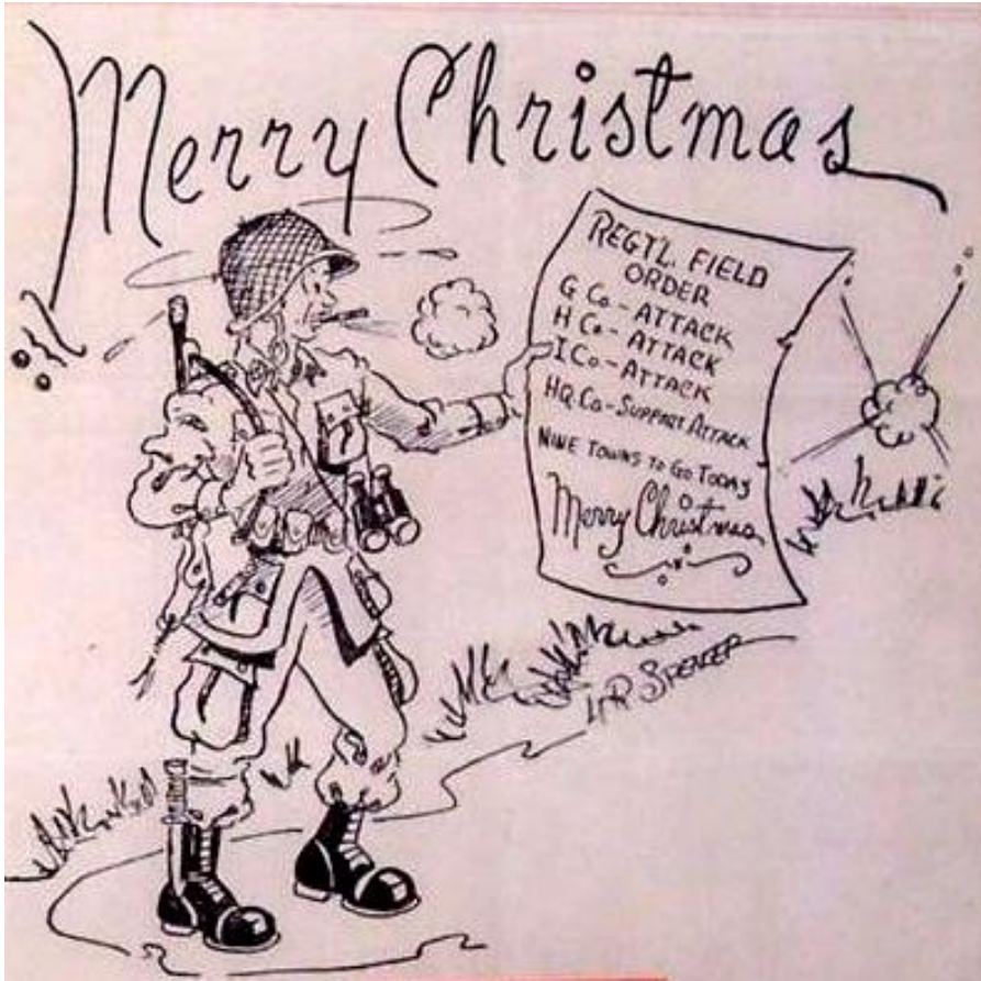
Christmas 1944 ...now on to Manhay