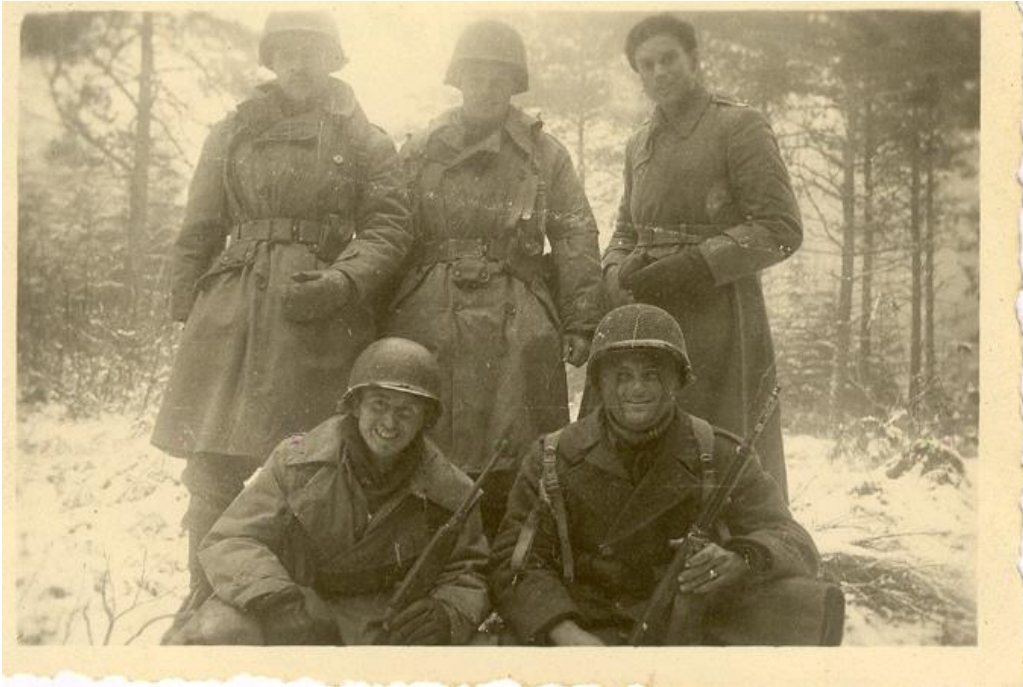
HQ Co. 3rd Battalion Officers Huertgen Forest January 1945