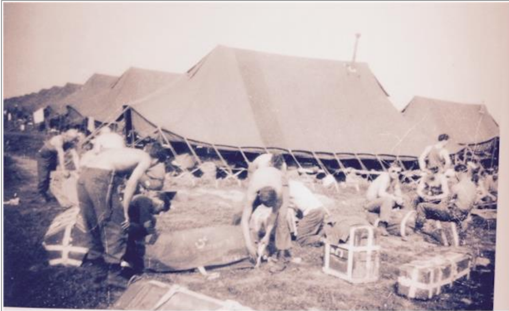
Artillerymen of the 60th packing howitzers in Italy

On the Bulge: it was the worst winter in 25 years. We didn't get new clothes or a shower in a month and half. It was so cold you couldn't smell anything. Gabe then recalled the tractor trailer-like showers: they cut two holes out, and you walked in one door, took a shower, and headed out with clean clothes, because the other trailer was heating hot water. The only thing was that we got someone else's clothes, but we were all about the same size and weight.