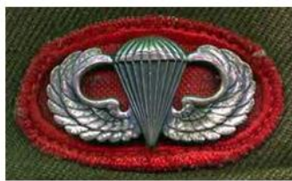
Airborne Artillery Background Trimming with Parachutist Badge

And I do not know about the 596 th jump oval. The 517 th oval was blue with a silver border ( http://www.517prct.org/logos.htm ), but I've never see a 596 th oval. Since the 596 th was part of the 517PRCT, maybe they could wear the same oval. Or maybe the oval were only intended for the 517 PIR and not the PRCT. Again, I think the rules were not official. Where on the website did you see the black and white photos?