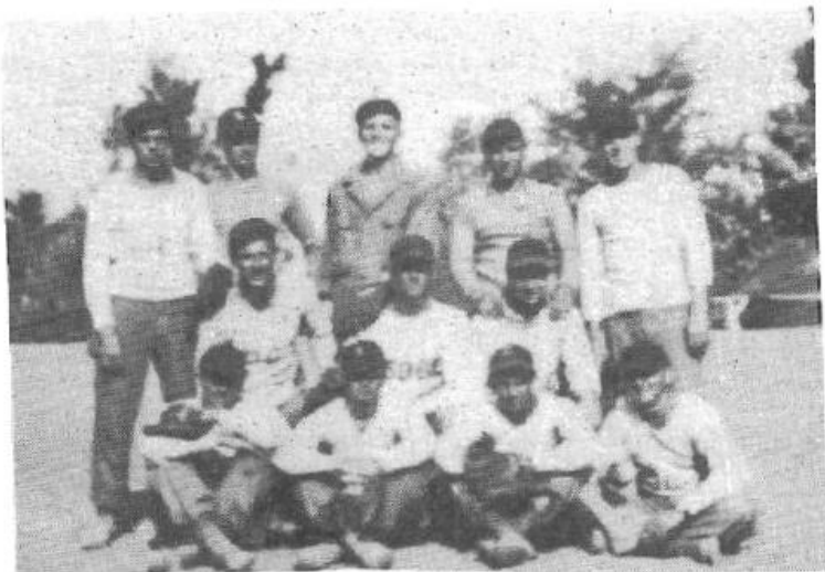
Part of the Frascati 596 baseball team.