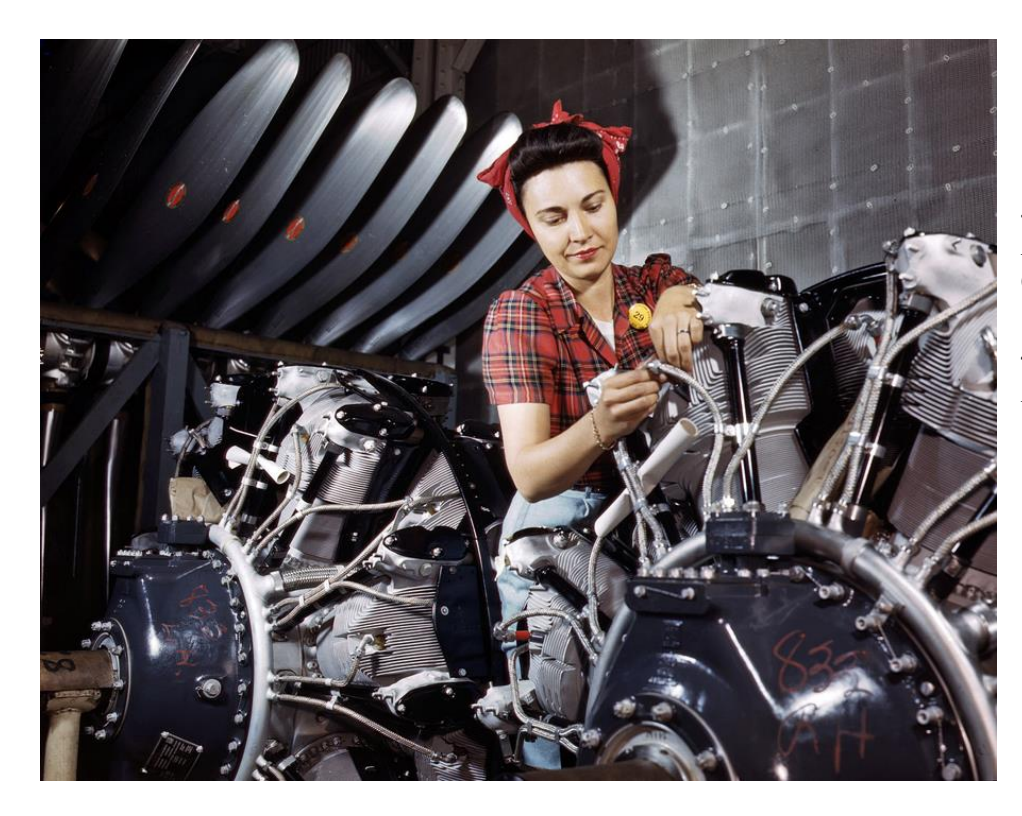
June 1942. Engine inspector for North American Aviation at Long Beach, California.