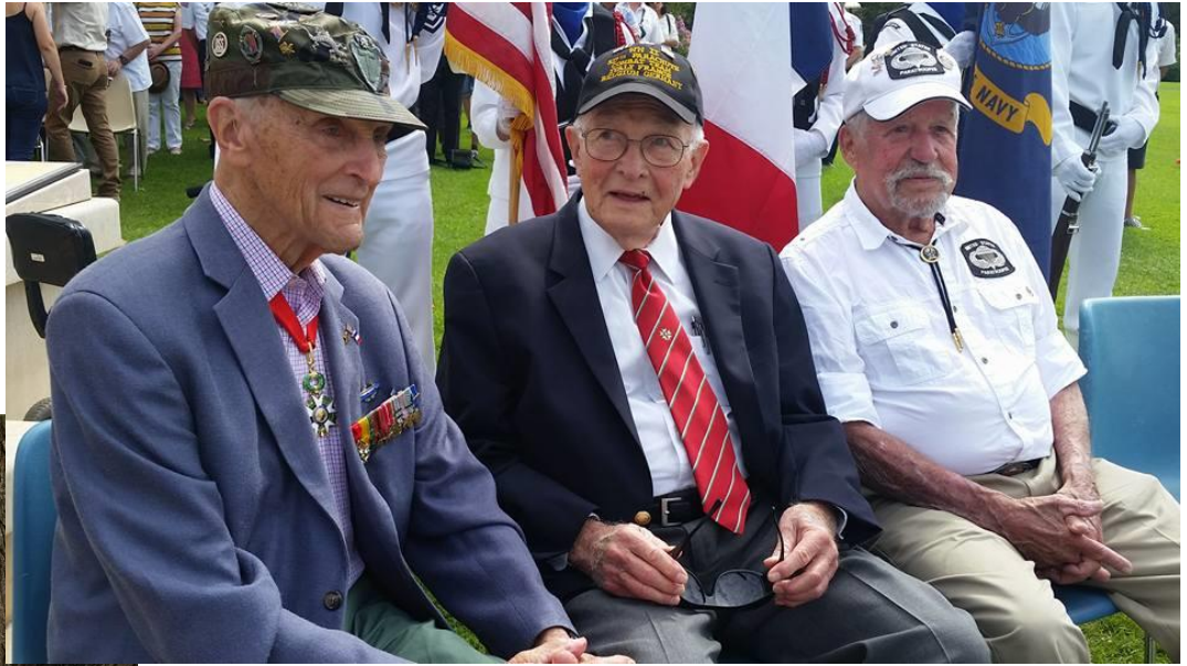
Ceremonies at Draguignan