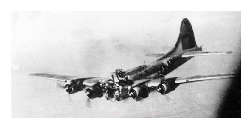
More U.S. Servicemen died in the Air Corps than the Marine Corps.