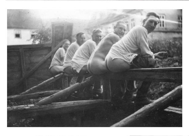
In World War II, British soldiers got a ration of three sheets of toilet paper a day. Americans got 22.