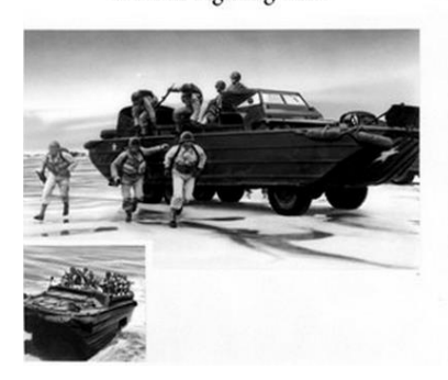
CHEVROLET Turns Out Volume for Victory for Our Fighting Men