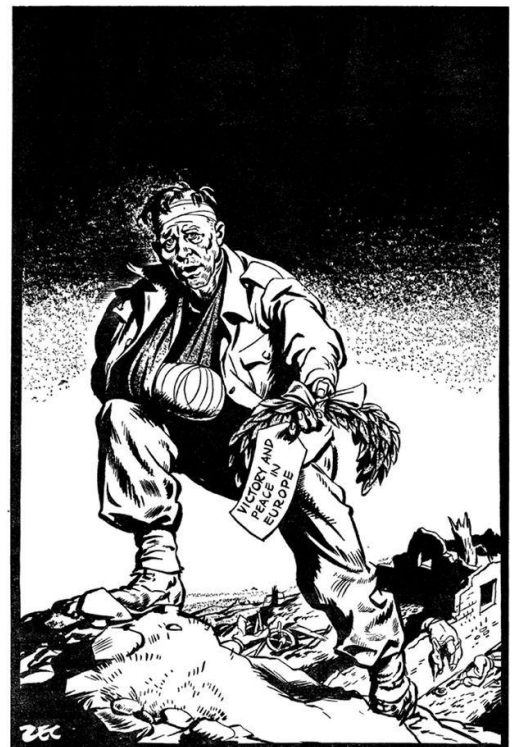
"Here you are—don't lose it again"

Massive celebrations also took place in Chicago, Los Angeles, Miami and especially in New York's Times Square.