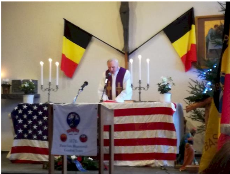
St Jacques' church - 2018 jan 6TH