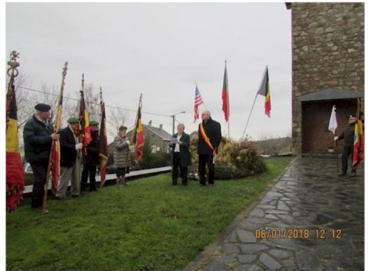
St Jacques - 2018 jan 6th flowers and homage at 517 th and 505th monument