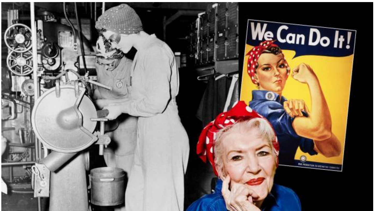
Naomi Parker Fraley used a picture of herself in a factory, which had been misidentified, to prove she was the inspiration for Rosie

Naomi Parker Fraley (August 26, 1921 – January 20, 2018) was an American war worker and waitress, and considered the likely model for the iconic "We Can Do It!" poster. She was unaware that the poster had become famous and in the interim Geraldine Hoff Doyle was credited as the model. The poster is erroneously referred to as the Rosie the Riveter poster, having become associated with the cultural icon in the 1980s.