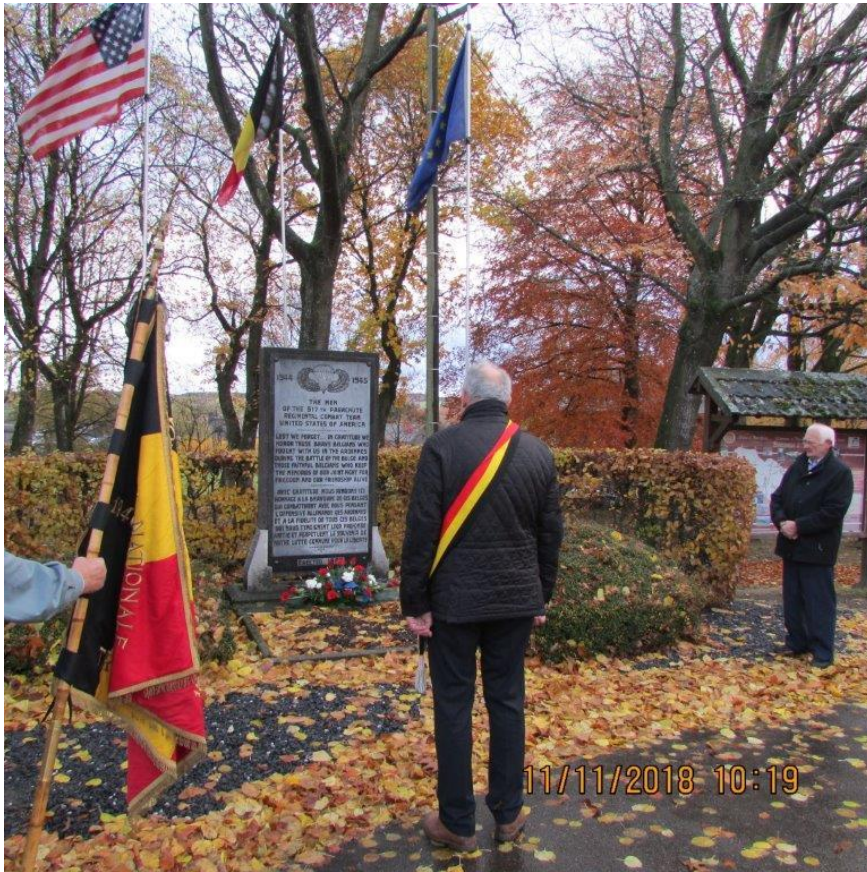
Wanne (Trois-Ponts) Armistice Day - 2018 NOV; 11