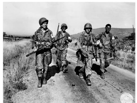
Near the French town of Le Muy, American paratroopers of the 509th Parachute Infantry Battalion hurry down Route D7 on the morning of August 15, 1944.