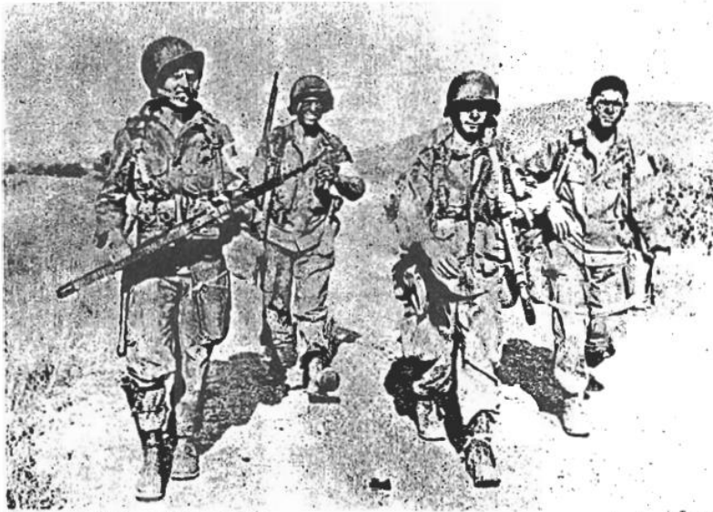
Members of the 509th Parachute Infantry Battalion shortly after landing in southern France.