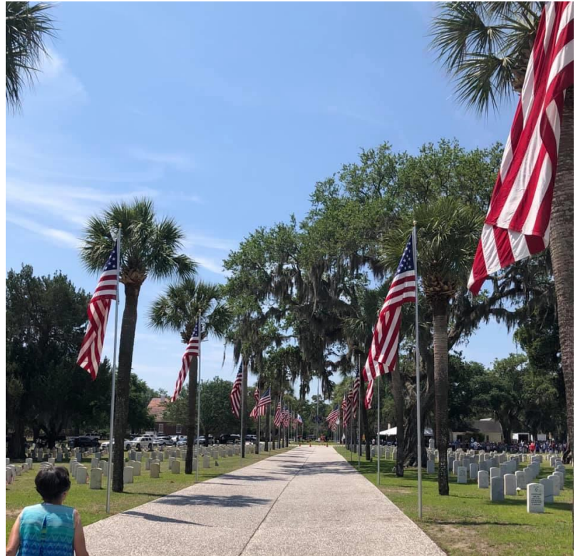
At Beaufort National Cemetery , South Carolina